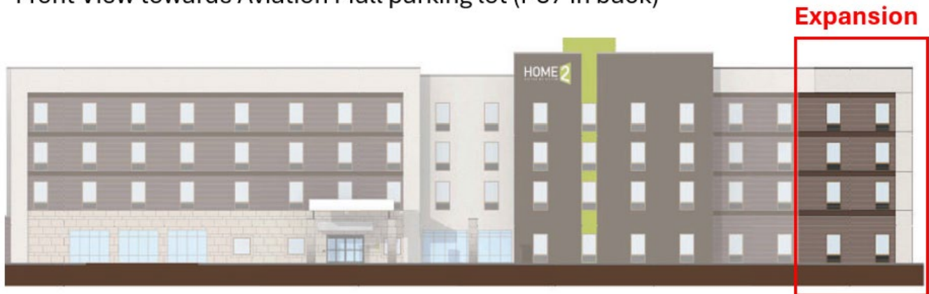
Front View towards Aviation Mall parking lot (I-87 in back)

The project involves the construction of a 2,200-square-foot, four-story, 16-room expansion, including updates to the parking area, sidewalk, stormwater management, utilities, and signage. This will be in addition to the existing footprint, which consists of 15,655 square feet and a 2,400-square-foot canopy.